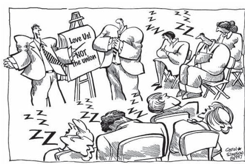
"Our anti-union message must be getting through. Nobody booed."

This committee will do the company's dirty work. They may distribute leaflets with lies about the IBEW. start rumors, or intimidate workers that support the IBEW.