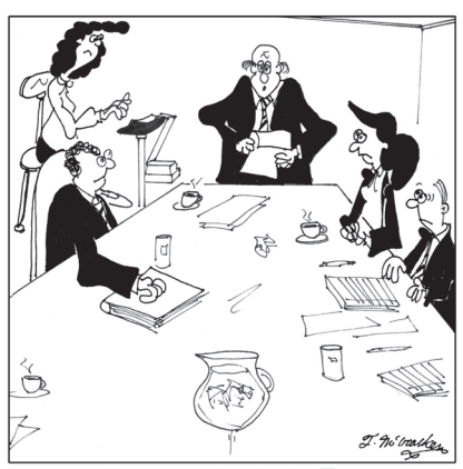
"Drop dead. Well that's a good start to our negotiations."

It is illegal for the company to say this to you directly, so instead they may say something like, "Remember, we don't have to agree to what you want in the contract."