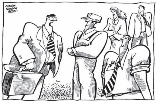
"...and stop smirking when I spread nasty rumors about the union. I have feelings too, you know."

The company will attempt to portray the authorization card as a legal document that makes you a member of the union and requires you to immediately begin paying dues—without the right to vote on a contract.