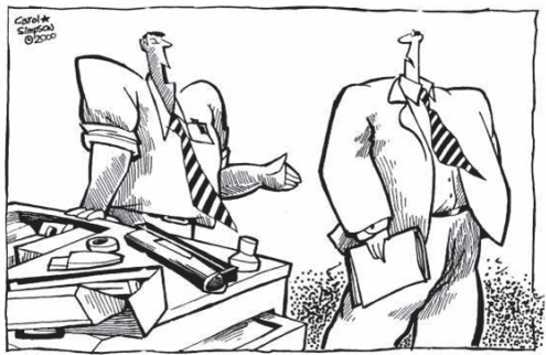
You shouldn't have told the employees to 'work smarter.' They all went and joined a union."

They may tell you that you will never get any benefit from paying union dues