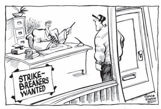
"We're not asking you to sell your soul.... we'd just like to rent it for a while."

They may tell you that while you are out during a strike you will be permanently replaced. They may ask you how you will support yourself and your family if you are forced to join the strike.