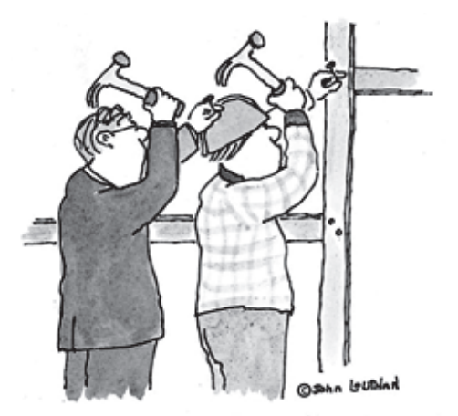
"Management and labor working in tandem."

They may tell you that you will not be able to speak with your supervisors or managers and that you will have no control over what is decided in your workplace.